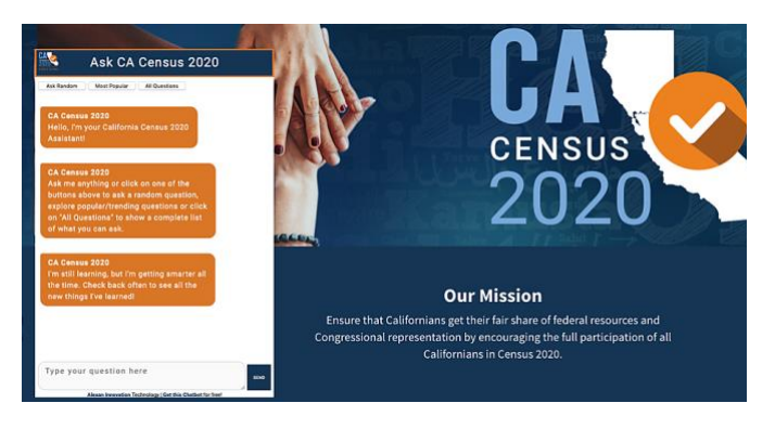
The Citizen360 oChat helped the 2020 California Census

The Citizen360 oChat Intelligent Response Agent is a fully managed interactive chatbot that can be installed on any webpage to help your visitors get quick, simple answers and information about any question they have, 24 hours a day and 7 days a week. All a visitor needs to do is click on the customized avatar and start typing their question or key word. Our oChat agent will begin searching for the answer to provide. If a visitor is not sure what to ask, our oChat agent displays the top questions and topics of the day to get the conversation started. And if English is not a language your visitor is comfortable with, they can switch mid-session to the other popular languages your website supports.